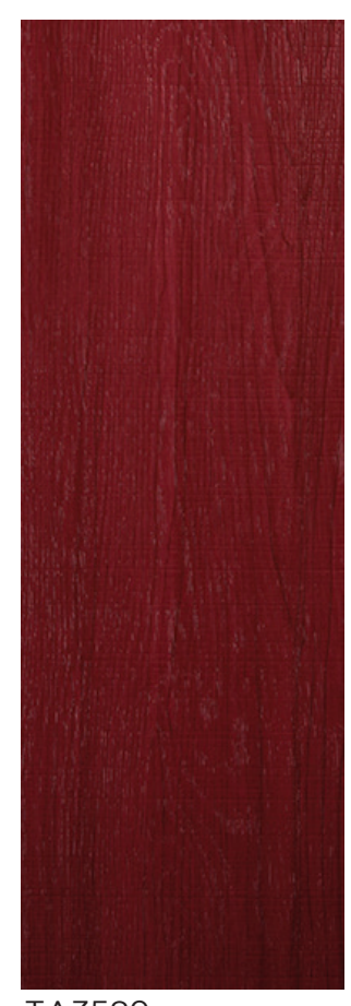
TA3589 Successful Scarlet