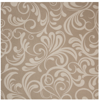
TA3527 At Last