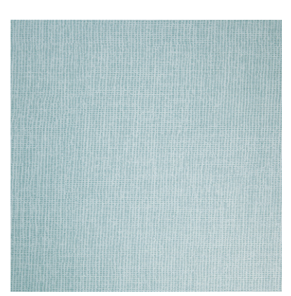
TA3534 Wrinkle Free