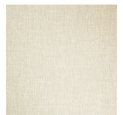
TA3532 Prim & Proper