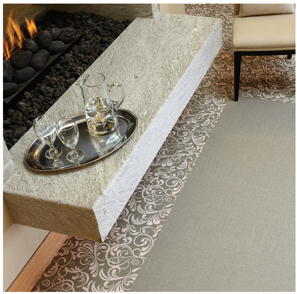
TA3521 Unforgettable / TA3533 Extra Starch

"Waltz's<sup>™</sup> fluid lines and elegant movement were inspired by the dance itself. The pattern is sophisticated and timeless as much as it is versatile. The emboss emulates a beautiful texture while the range of colors provide a multitude of options for use in any design segment. Each colorway draws inspiration from classic songs and the emotion evoked by their lyrics and sound."