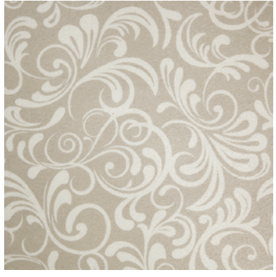
TA3524 Cheek to Cheek