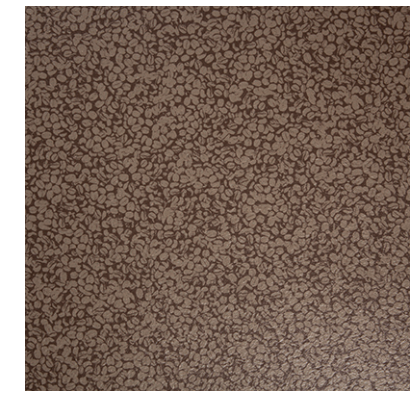
TA3552 Like a Box of Chocolates

"Make your life - and your installation - whatever you want them to be. This pattern can be the star of the show or a great supporting act to one of the more graphic patterns in this collection. The color names remind us of what's important and that life is truly full of great surprises."