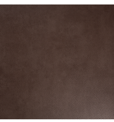
TA32111 Skinny Minny