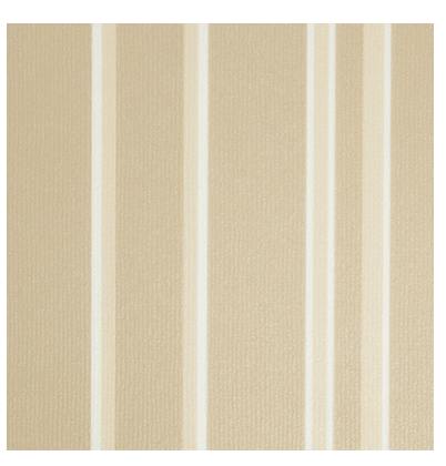
TA3573 Talk to the Hand