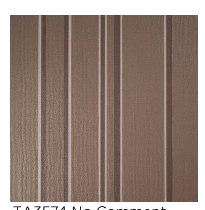
TA3574 No CommentTA3573 Talk to the HandNOTE: Printed images are for reference only and may not reflect actual product color.