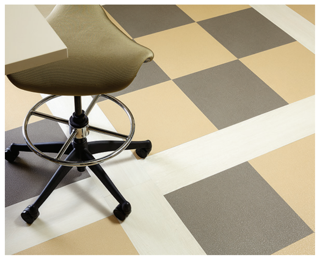
TA20322 Champagne Toast & TA20323 Paparazzi / TA3582 Colossal Cream