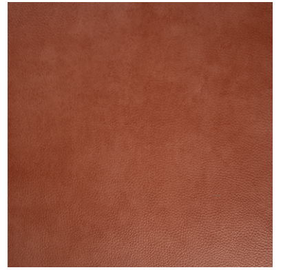
TA32110 SPF 0

"Chic & Luxurious like leather, yet durable & simple to maintain? WOW, that's Skintastic! Now pair this with Life Is...™ for a delicious combination of rich color & texture suitable for any application."