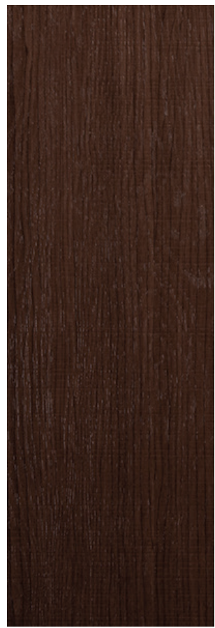
TA3587 Confident Cocoa