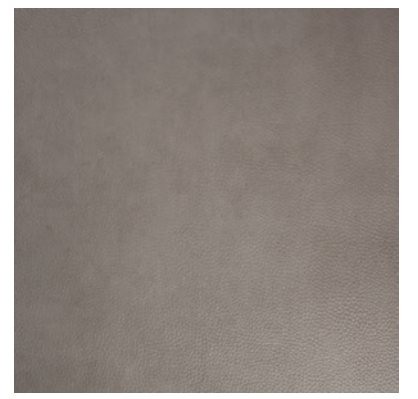
TA3219 Skin Tight