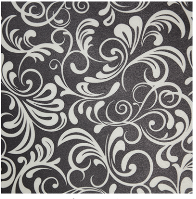
TA3525 Ebony & Ivory

"Waltz's<sup>™</sup> fluid lines and elegant movement were inspired by the dance itself. The pattern is sophisticated and timeless as much as it is versatile. The emboss emulates a beautiful texture while the range of colors provide a multitude of options for use in any design segment. Each colorway draws inspiration from classic songs and the emotion evoked by their lyrics and sound."