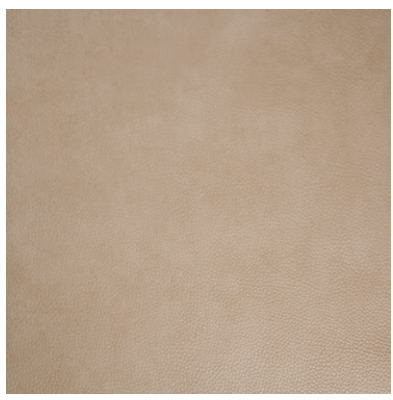
TA3218 Skin I'm In

"Chic & Luxurious like leather, yet durable & simple to maintain? WOW, that's Skintastic! Now pair this with Life Is...™ for a delicious combination of rich color & texture suitable for any application."