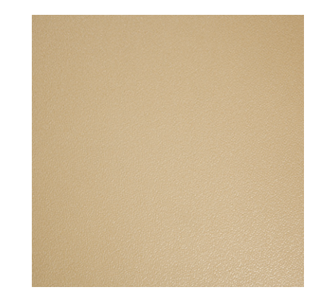
TA20322 Champagne Toast