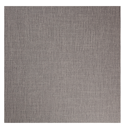
TA3533 Extra Starch