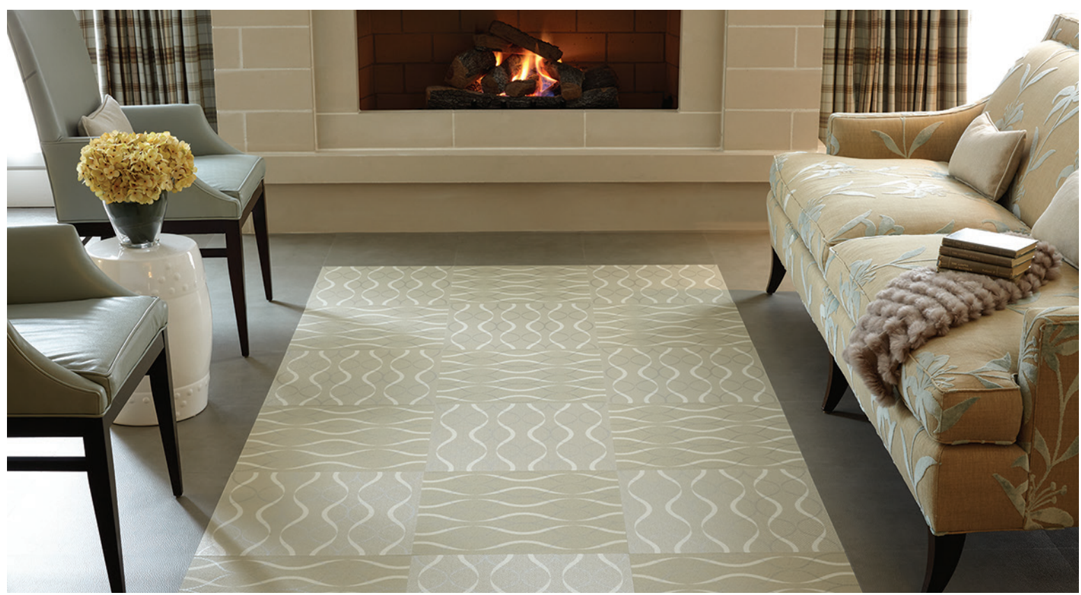
TA3542 Smoke & Mirrors / TA3219 Skin Tight