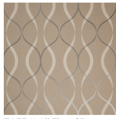
TA3541 All That Glitters

"It sounds fancy, because it is! Inspired by ribbons and pearls, this fabulous pattern is subtle, but far from shy. With just a hint of silver metallic, each colorway can be paired with gold, silver or any other metallic colors or details your heart desires."