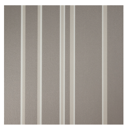
TA3571 Plead the 5th