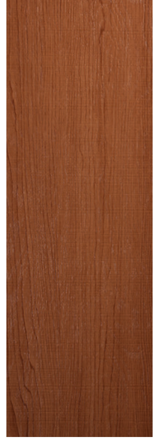
TA3586 Ambitious Amber