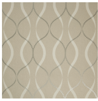
TA3542 Smoke & Mirrors