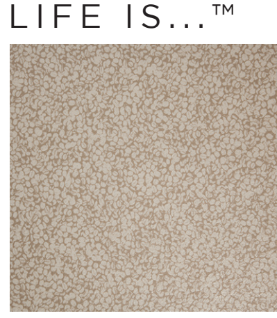
TA3551 Too Short

"It sounds fancy, because it is! Inspired by ribbons and pearls, this fabulous pattern is subtle, but far from shy. With just a hint of silver metallic, each colorway can be paired with gold, silver or any other metallic colors or details your heart desires."