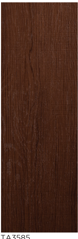
TA3585 Brilliant Brunette