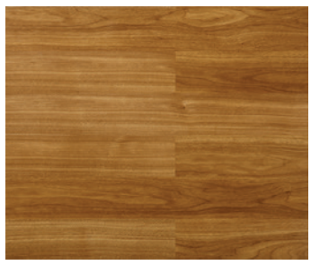
51022 Mountain Walnut