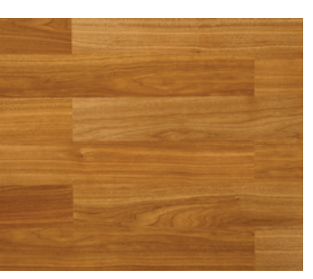
51021 Royal Oak