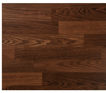
53905 Gunstock Oak