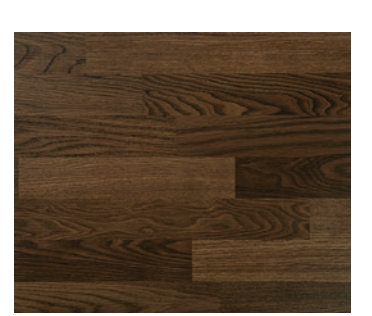
53904 Tru Brown Oak