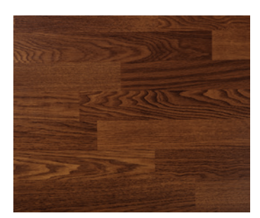
51033 Sable Cherry