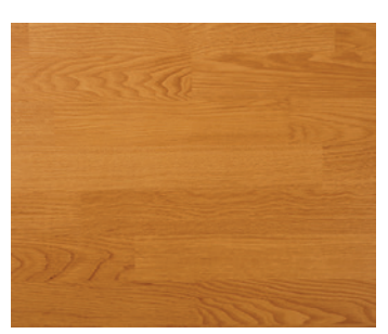
51032 Rainier Cherry