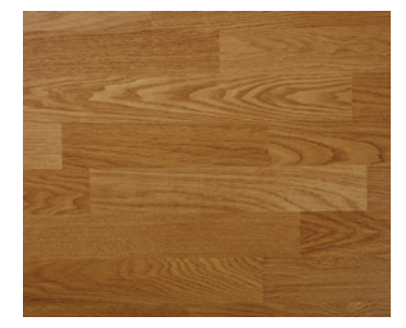
53802 Southern Oak