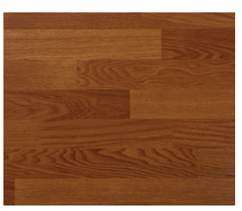
53804 Northern Oak