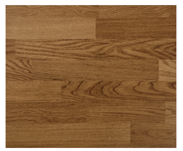
53907 Chestnut Oak