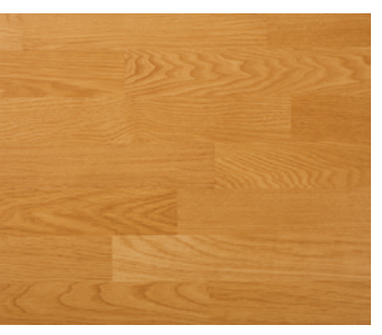
53901 Natural Red Oak