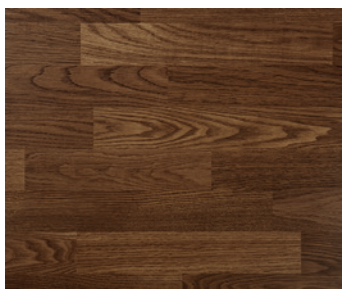
53903 Provincial Oak