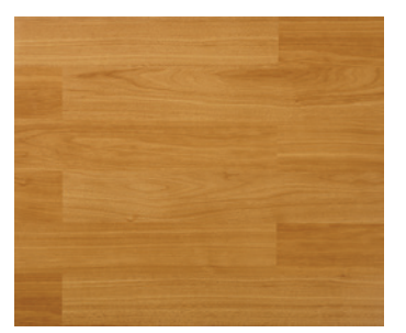
51023 Golden Pecan