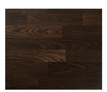
53906 Dark Alder